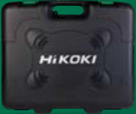
18V Gasless 65mm Metal Bracket Nailer Kit NR3665DA(GMZ)