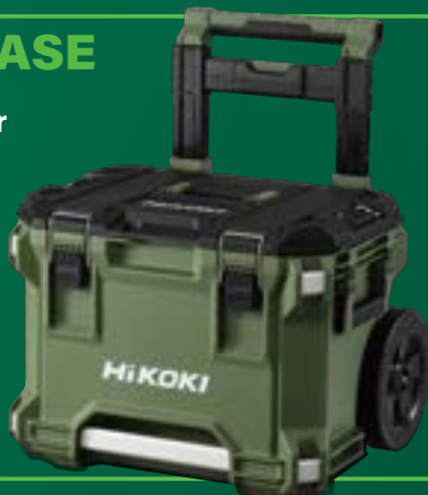
Multi Cruiser Portable Tool Box 379487