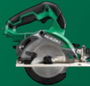
18V Brushless 125mm Circular Saw BARE TOOL C1805DA(G2Z)