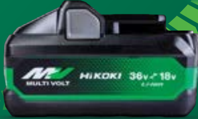
BSL36B18X HIGH OUTPUT BATTERY