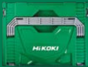
18V Gasless 90mm Framing Nailer Kit NR1890DCA(GMZ)