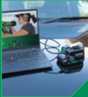
Charge large electronic devices like laptops