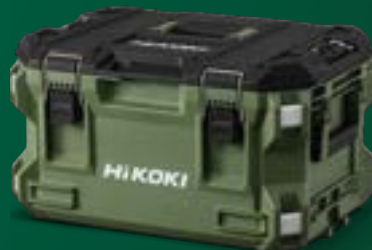
Multi Cruiser Large Tool Box 379484