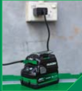
Charge your HiKOKI batteries via mains power