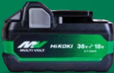
BSL36A18X HIGH OUTPUT BATTERY