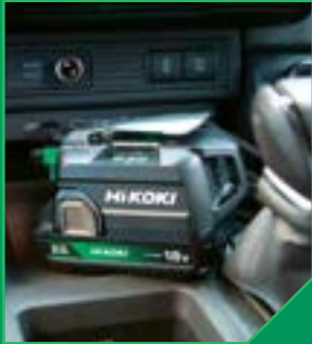
Charge your HiKOKI batteries on the go with USB PD