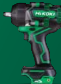
36V Brushless 1/2" 770Nm Impact Wrench BARE TOOL WR36DE(G4Z)