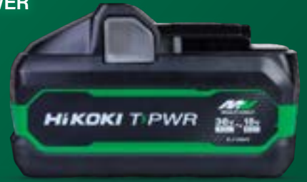
NEW BSL3640MVT HIGH OUTPUT TABLESS BATTERY