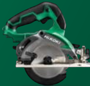
18V Brushless 125mm Circular Saw BARE TOOL C1805DA(G2Z)